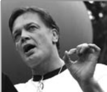
Dr. Andrew Wakefield

The disgraced doctor who caused public panic with his flawed research into MMR vaccine is seeking to rekindle his career in America by recruiting immigrant African children for a controversial study.